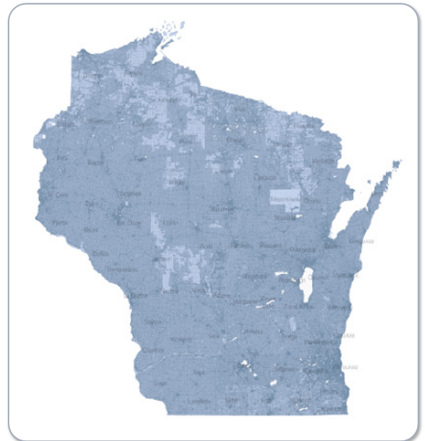
Figure 1. V12 Parcel Coverage (click for larger view)